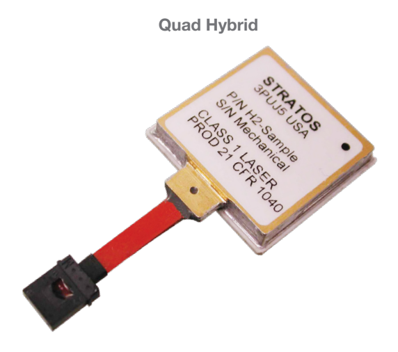
H10 (10G Quad) Socketed Solution

The Quad Hybrid transceiver family supports data rates from 1G to 10Gbps, with product family options for high RX sensitivity or for extra optical TX launch power.