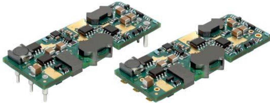
Figure 2 - DC to DC type converter

Airflow for a U channel supply would never be blown across the U channel. However many Dc to Dc converters, like the one in Figure 2, will require forced airflow across the converter and not from input to output. Always check the specification for the specified amount of airflow needed and the direction of the airflow.